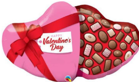
box of chox