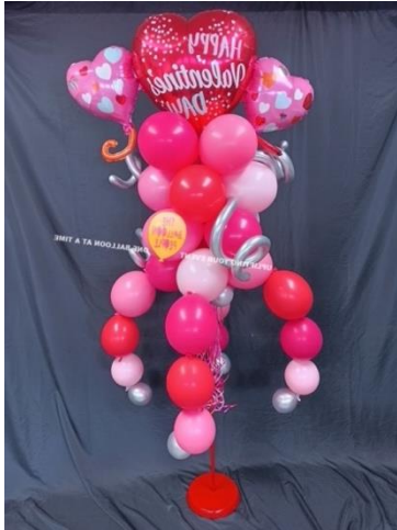
1. Original Pole - $150.00