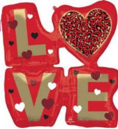
Stacked love red