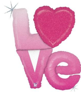
stacked love ombre