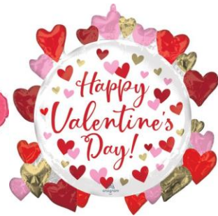
circle of hearts