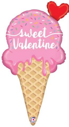
Ice cream sweet