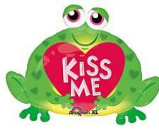
Kiss me frog